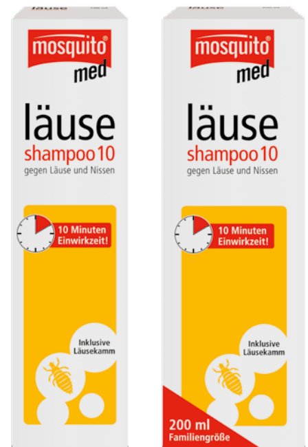
Head Lice Shampoo10 100 ml PZN 10415469

Do not store at over 25 degrees. Do not use mosquito® med Head Lice Shampoo10 after the expiration date.